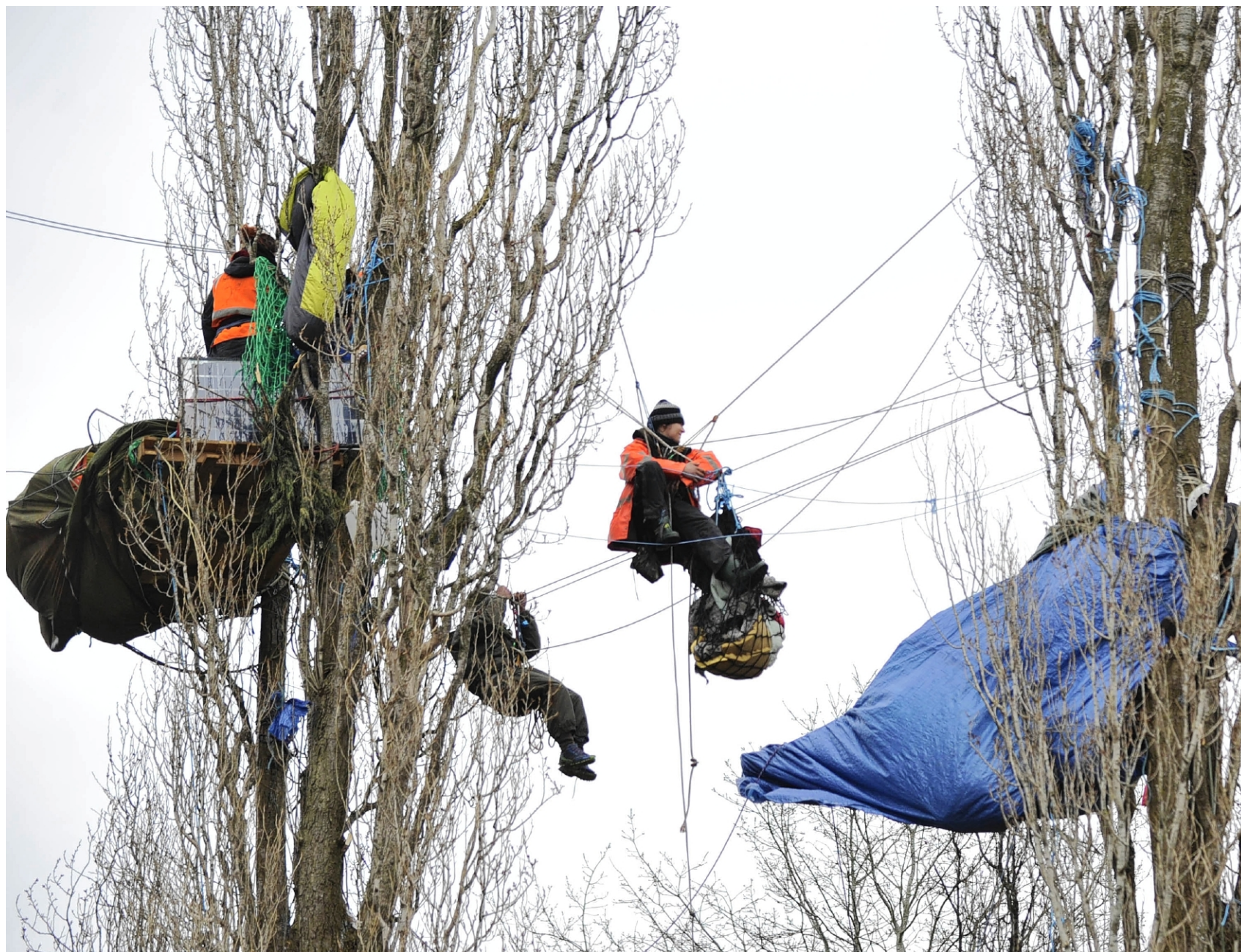
Bailiffs move in on Rising Up protestors at the Stapleton Allotments, on land which will be used for the Metrobus